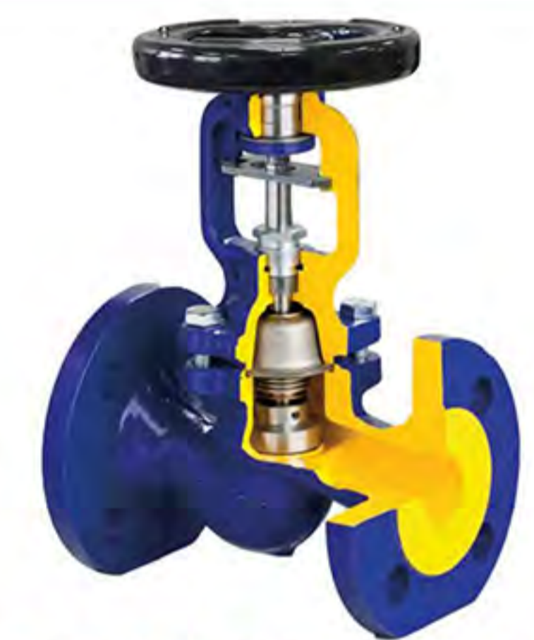
GLOBE VALVE BELLOWS BODY :CAST IRON CONN :PN16 SIZE :1/2"-12"