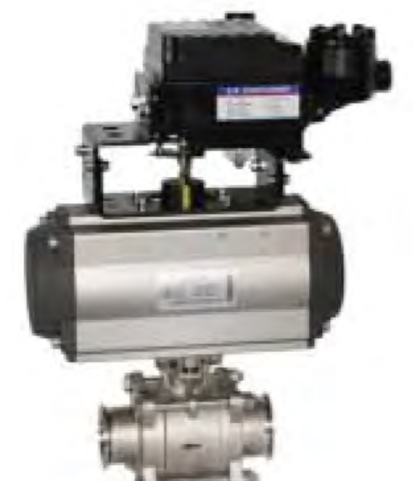
3PC Ball Valve C/W Actuator Positioner