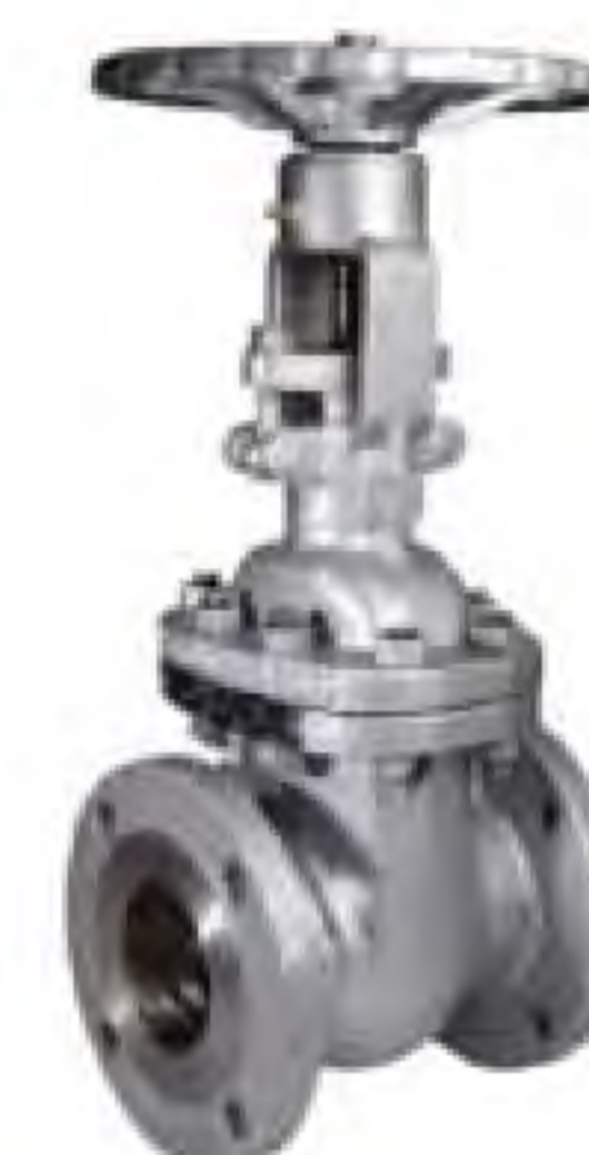
GATE VALVE Body : CAST IRON Conn : JIS 10K Rating : 10K Size : 1/4"-12"