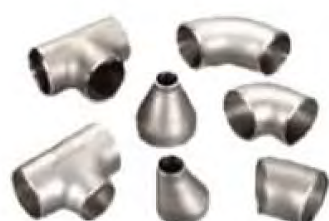
TEE, ELBOW, REDUCER