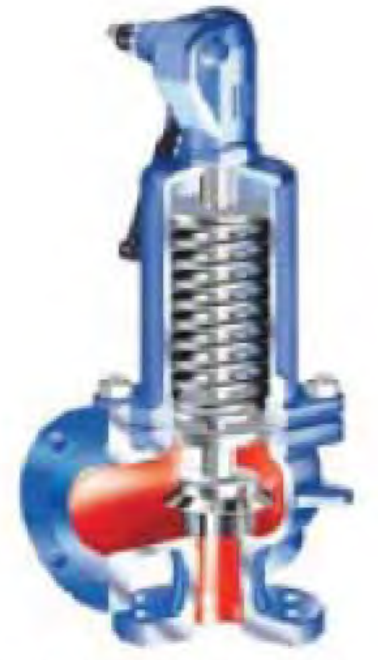
ARI SAFETY VALVE GG25,GGG 40.3 C/S PN16, PN25, PN40