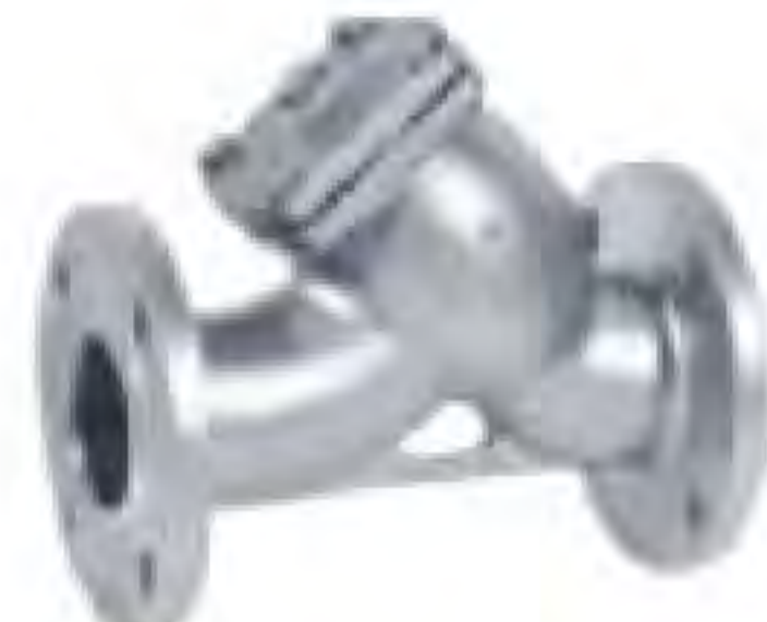
Y-STRAINER VALVE Body : 304, 316 Conn : JIS10K Rating : 10K Size : 1/2'-12'