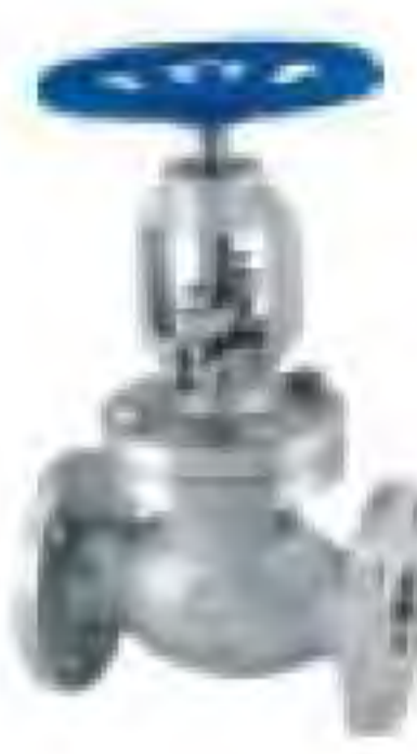
GLOBE VALVE Body : 304,316 Conn : JIS10K Size : 1/4"- 12"