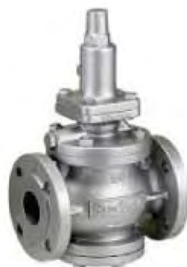
Pressure Reducing Valve