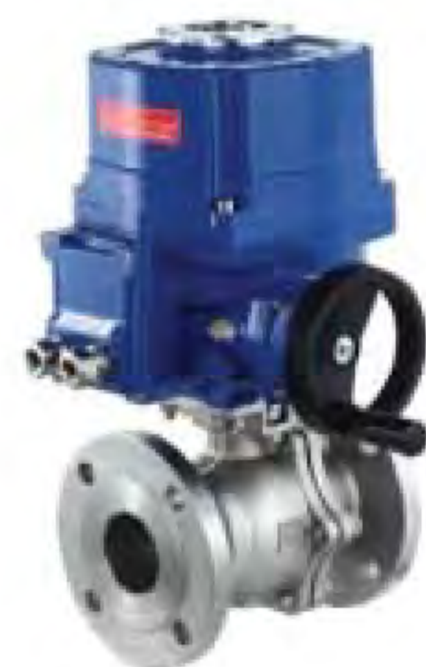
Ball Valve C/W Motorized