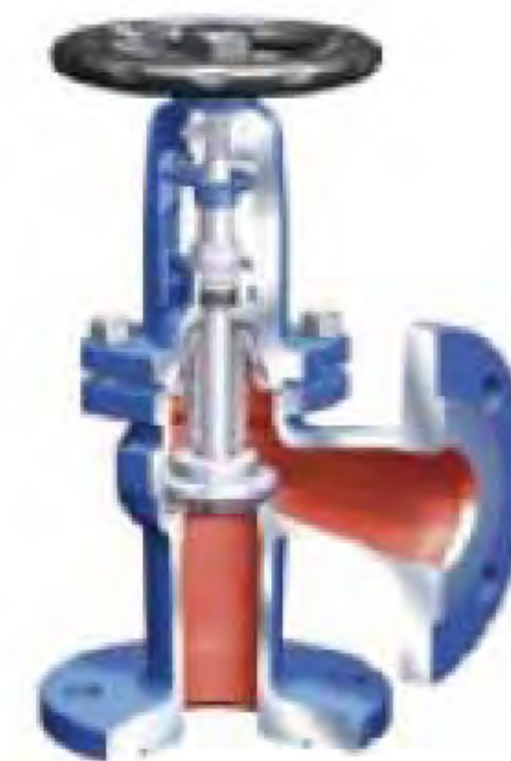
ARI FABA ANGEL TYPE GG25,GGG 40.3 C/S PN16, PN25, PN40