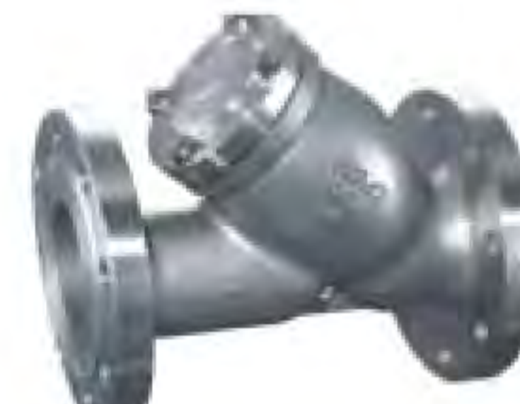
Y-STRAINER VALVE Body : 304, 316 Conn : ANSI150 Rating : ANSI150 Size : 1/2'-12'