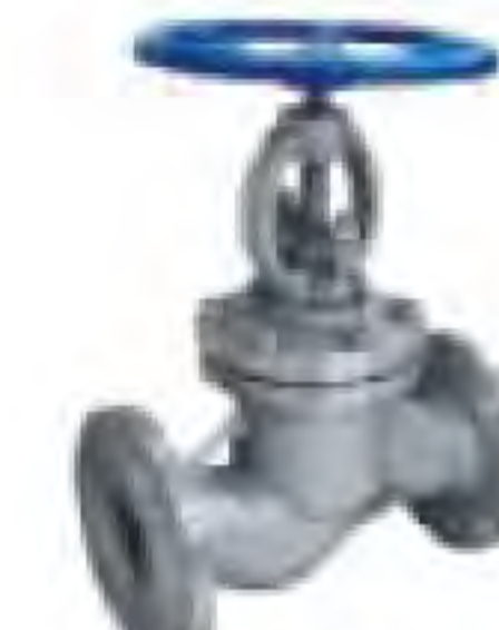
GLOBE VALVE Body : 304,316 Conn : PN16 Disc : 304,316 Size : 1/4"- 12"