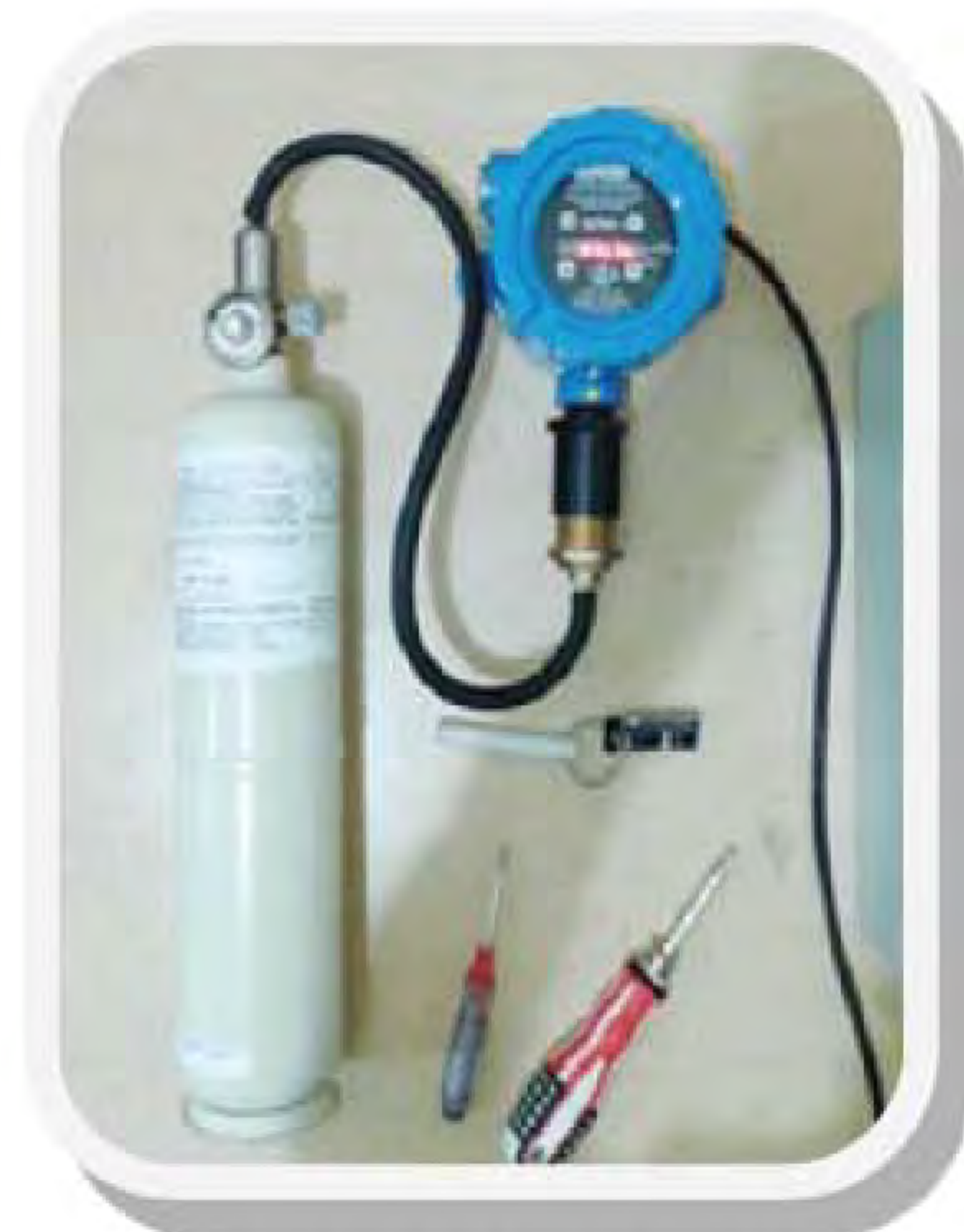
Calibrations gas detector