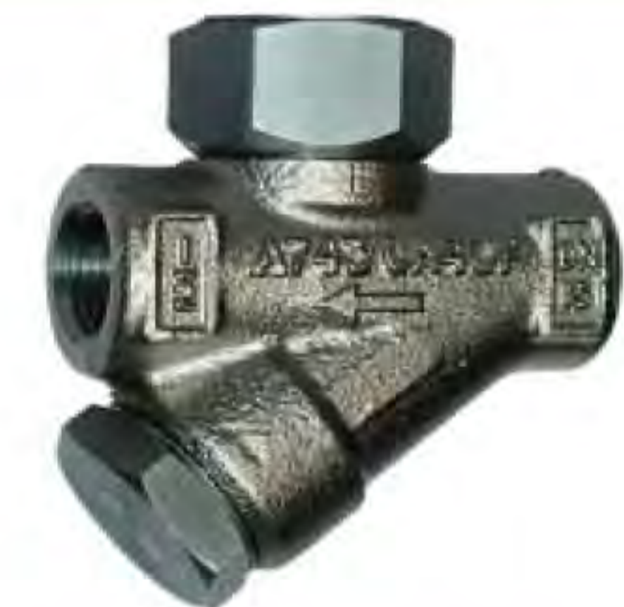
THERMODYNAMIC STEAM TRAP Body : WCB , SS304 Conn : BSPT Size : 1/2"-2"