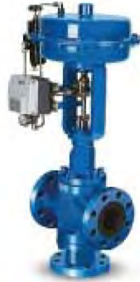
3WAY CONTROL VALVE Body : WCB Conn : PN16-ANSI1500 Size : 1/2"- 12"