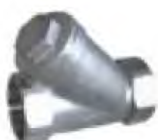
Y-STRAINER VALVE Body : 304, 316 Conn : BSPT Rating : #800 Psi Size : 1/4"-4"