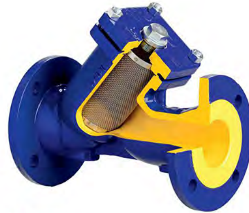
Y-STRAINER BODY :CAST IRON CONN :PN16 SIZE :1/2"-12"