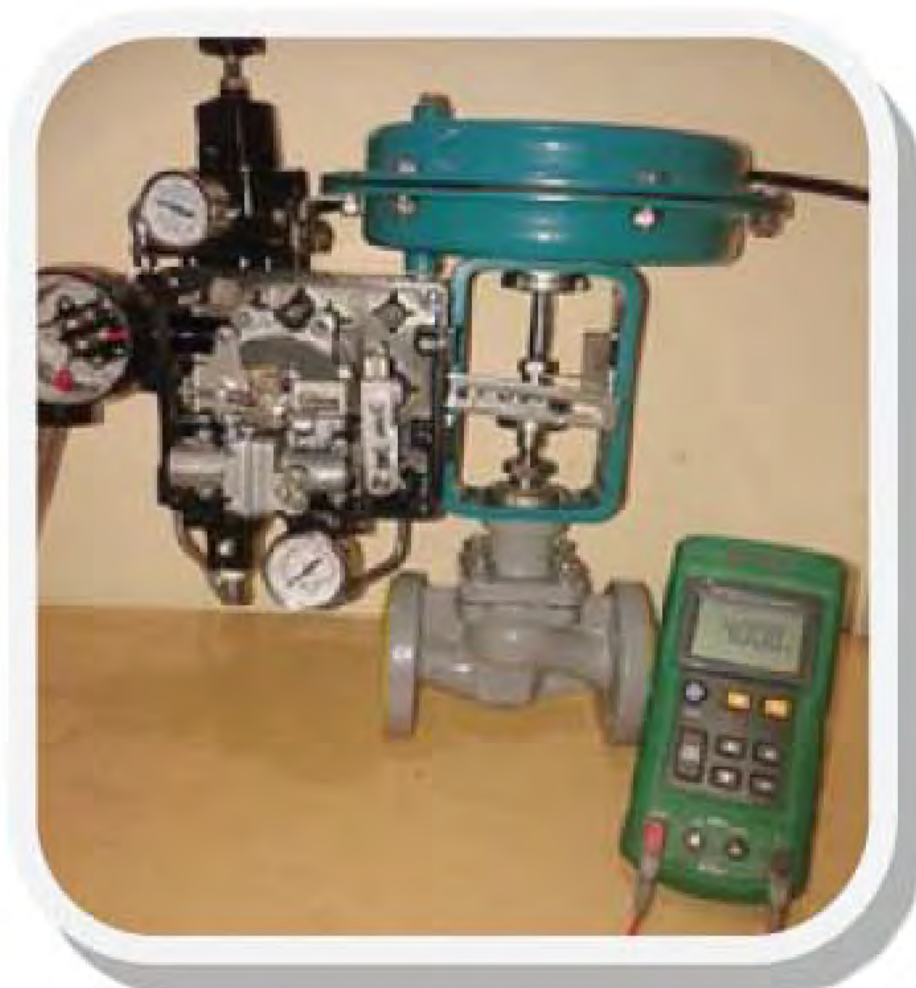
Kalibrasi Control Valve