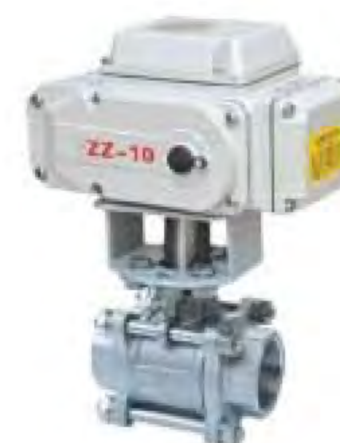
3PC Ball Valve C/W Motorized