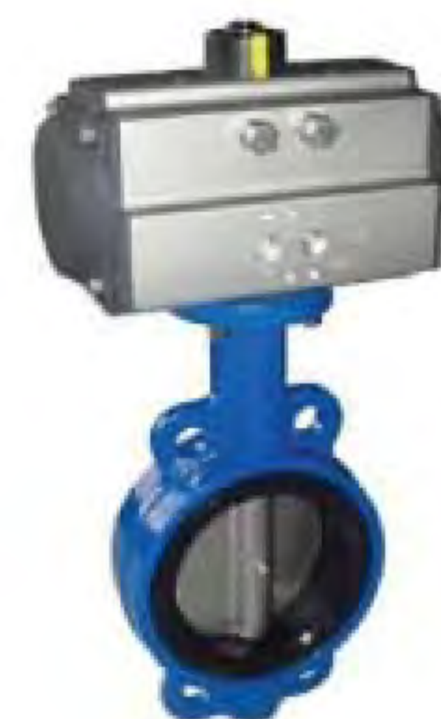
Butterfly Valve C/W Actuator