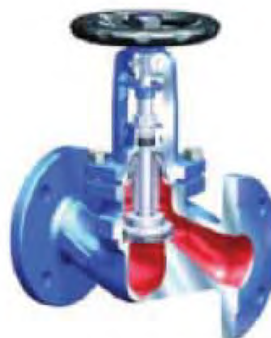
ARI FABA GG25,GGG 40.3 C/S PN16, PN25, PN40