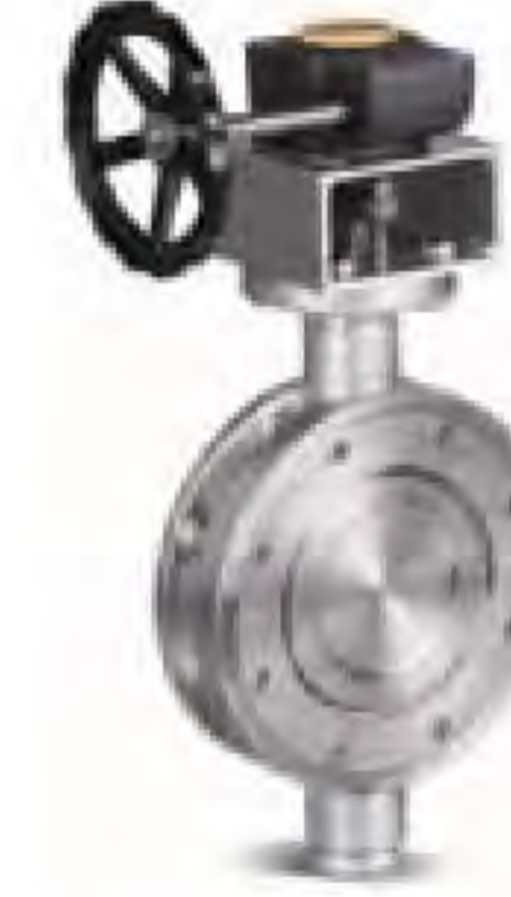
M2M BUTTERFLY VALVE Body : WCB,304,316 Conn : ANSI150-1500 Size : 1/2"- 12"