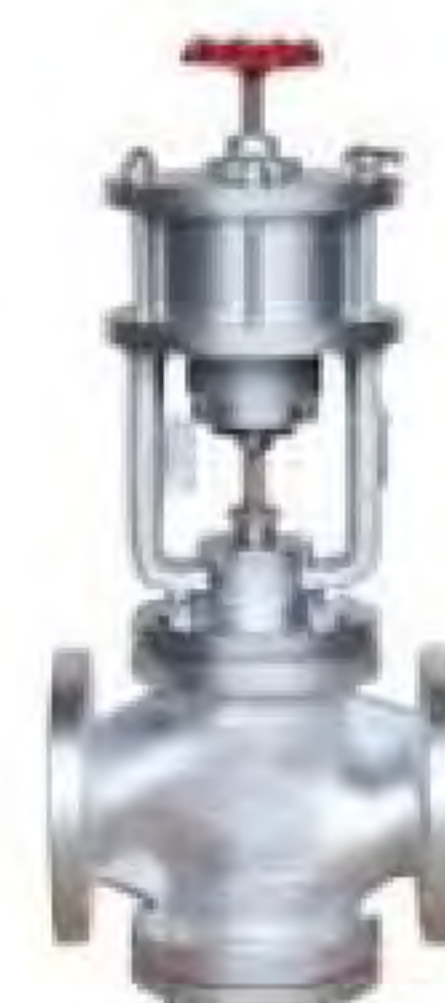
Cylinder Control Valve