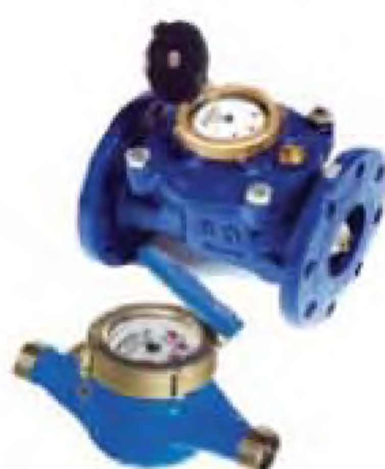
Cold Water Meter