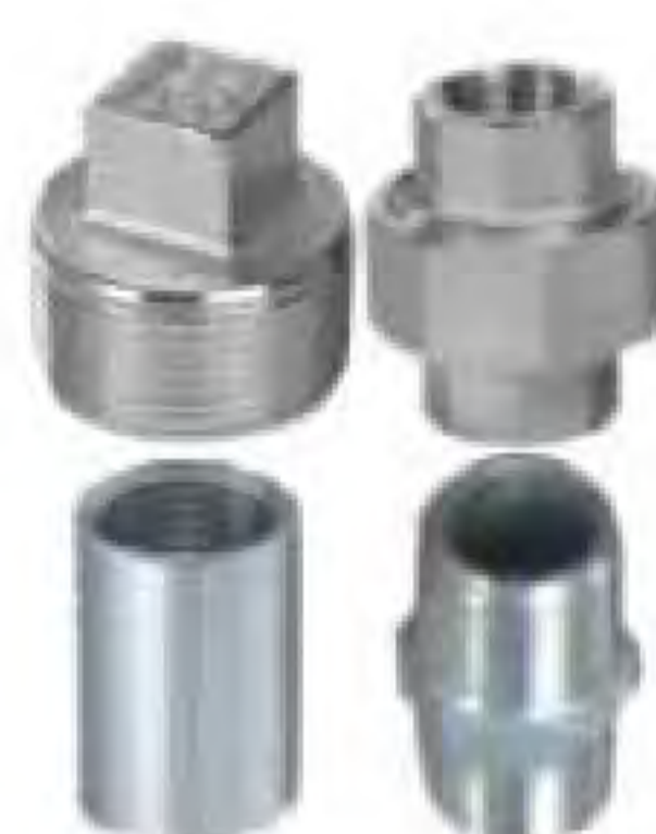
Square Plug, Union, Socket Double