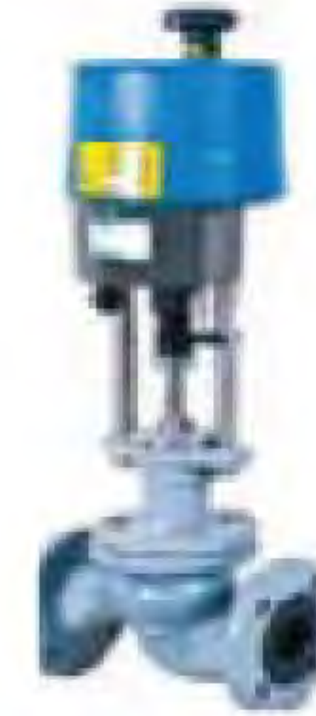
ELECTRIC CONTROL VALVE Body : CI,DI,CS,304/16 Conn : PN16-PN40 Size : 1/2"- 12"