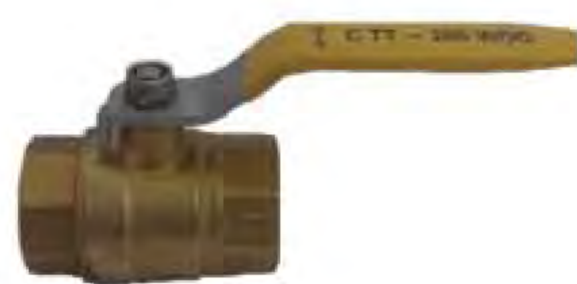
BALL VALVE Body : BRASS Conn : BSPT Rating : #400 Psi Size : 1/4"-4"