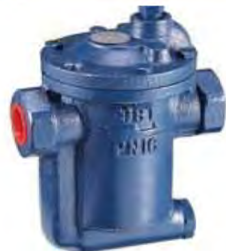
INVERTED BUCKET STEAM TRAP Body : WCB Conn : BSPT Rating : PN16 Size : 1/2"-2"