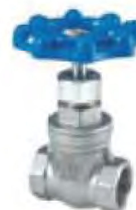
GATE VALVE Body : 304,316 Conn : BSPT Size : 1/4"- 4"/200