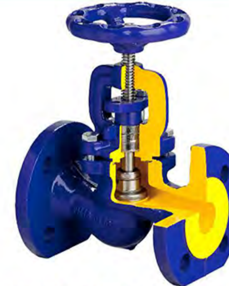
GLOBE VALVE GLAND BODY :CAST IRON CONN :PN16 SIZE :1/2"-12"