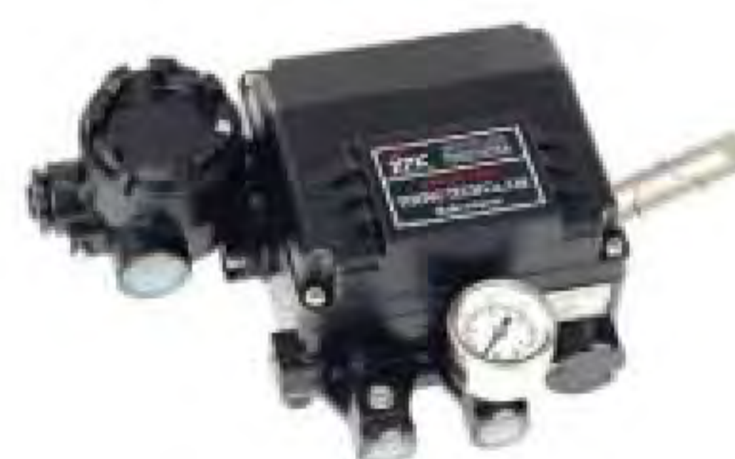
E/P Positioner Linier, Rotary