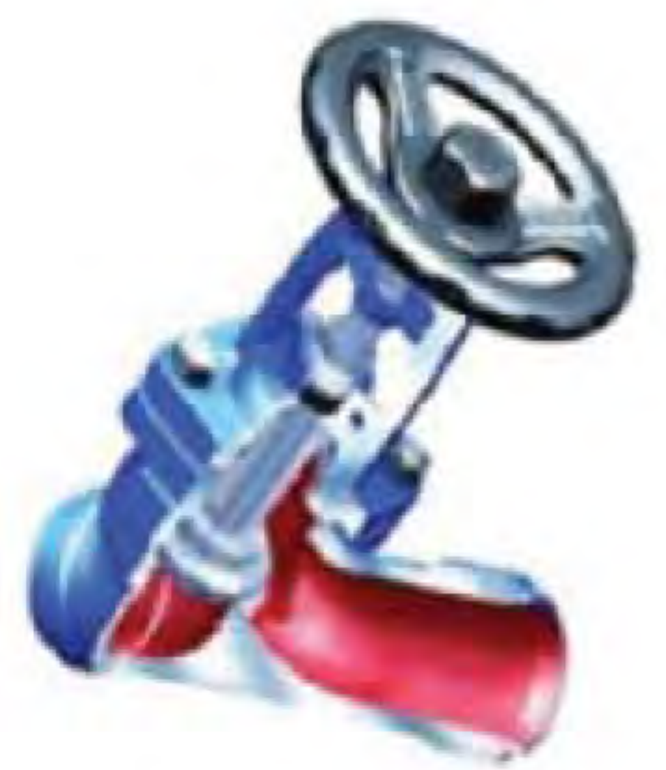
ARI FABA Y-TYPE GG25,GGG 40.3 C/S PN16, PN25, PN40