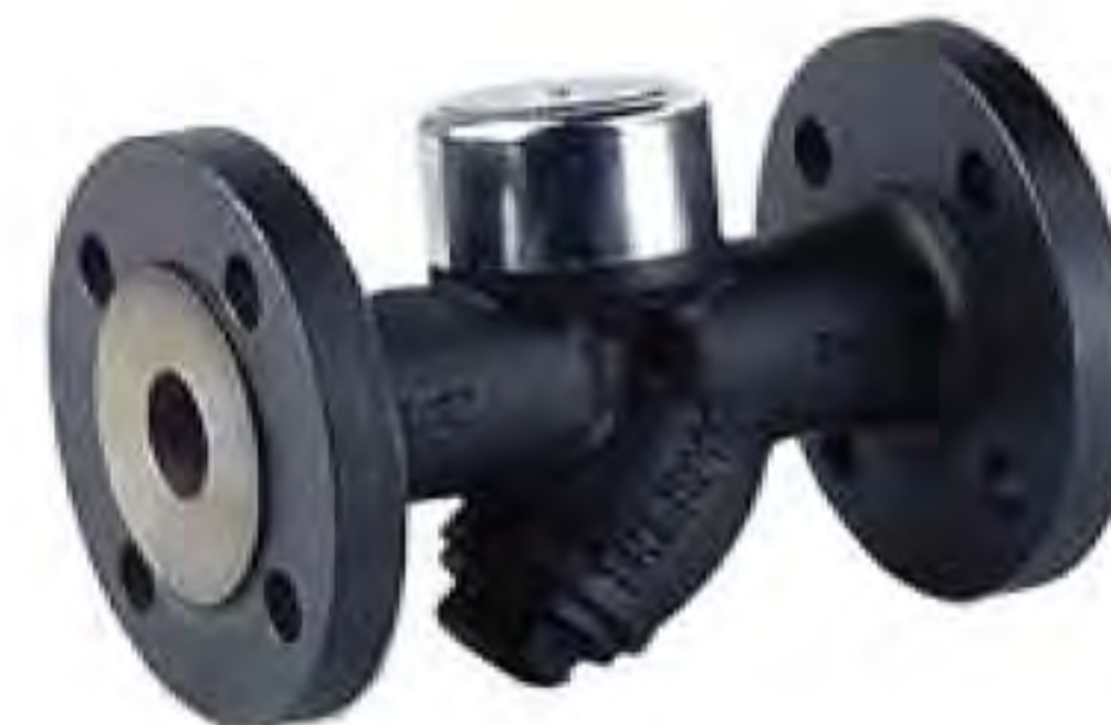
THERMODYNAMIC STEAM TRAP Body : WCB Conn : PN40 Size : 1/2"-3"