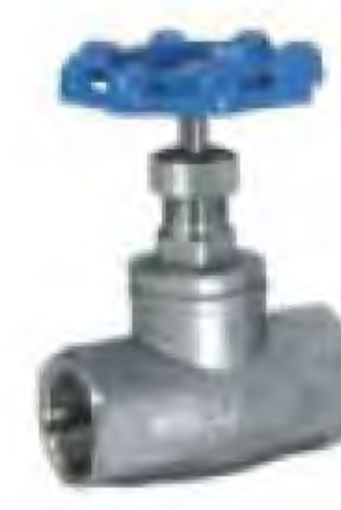
GLOBE VALVE Body : 304,316 Conn : BSPT Size : 1/4"- 4"/200