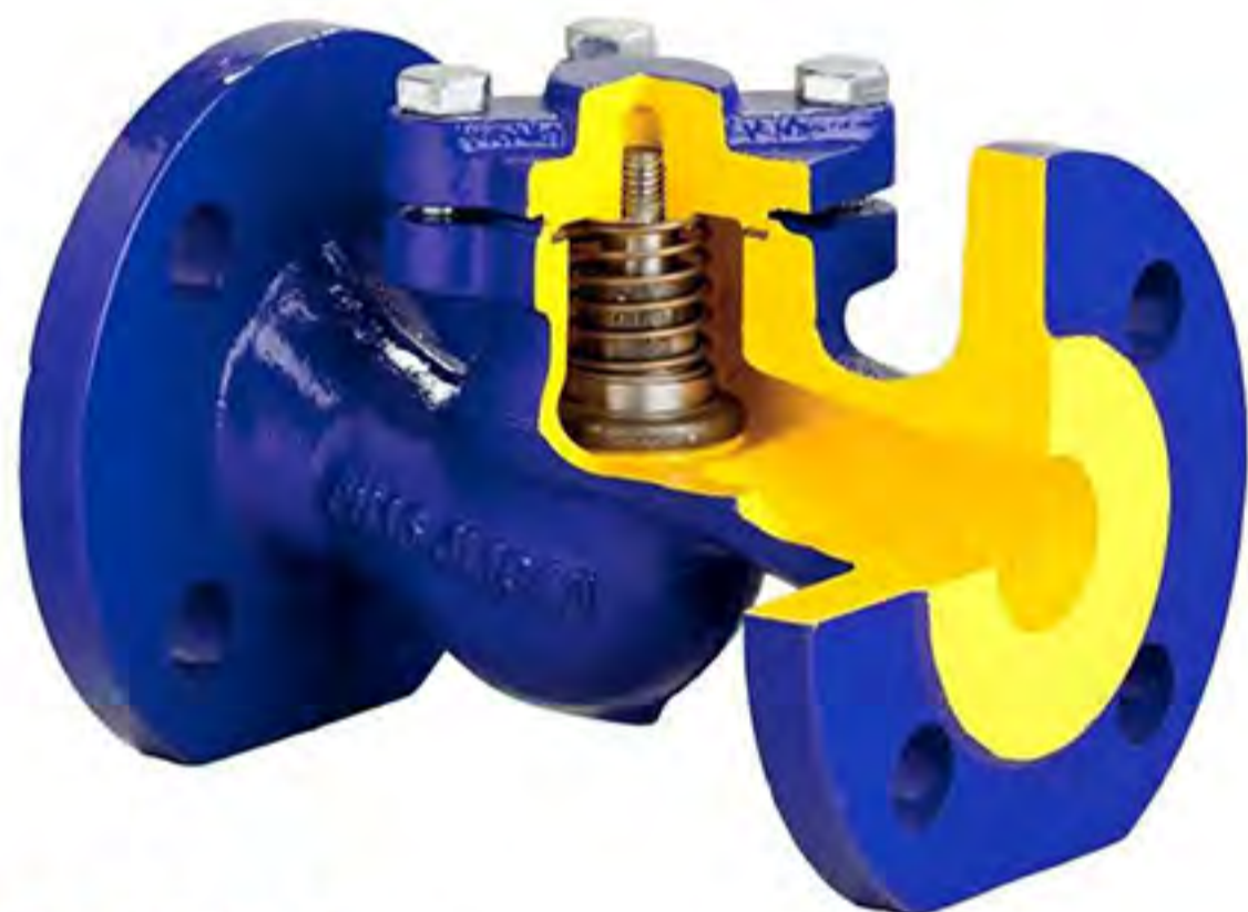
CHECK VALVE BODY :CAST IRON CONN :PN16 SIZE :1/2"-12"