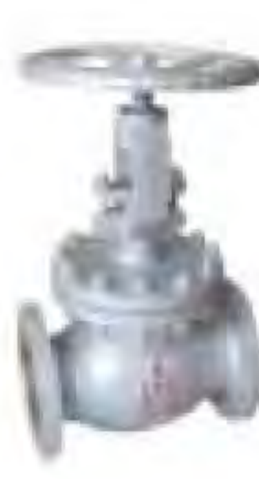
GLOBE VALVE Body : WCB Conn : ANSI150,300 Size : 1/4"- 12"