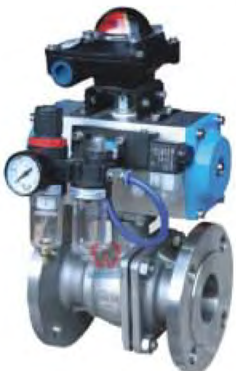
Ball Valve C/W Actuator