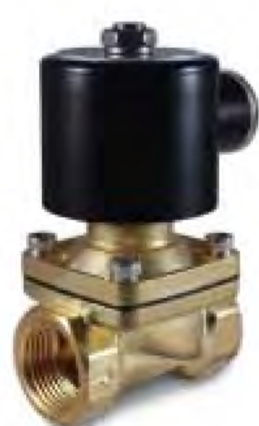
Solenoid Valve water/steam