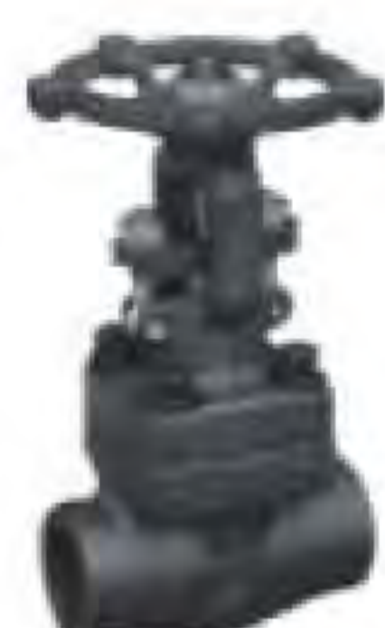
GATE VALVE Body : WCB A105 Conn : NPT, SW,BW Size : 1/4"- 2"