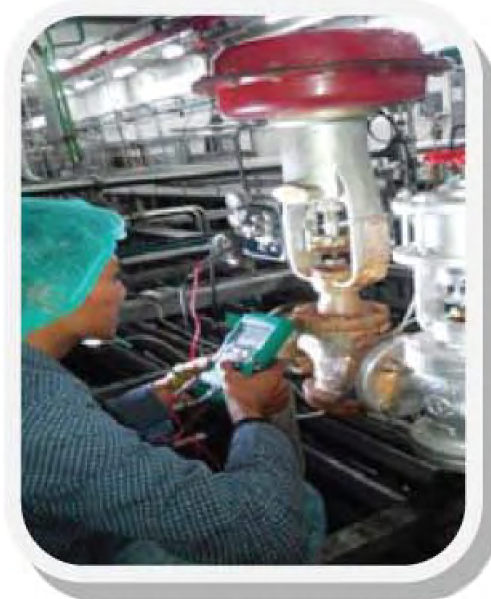
Technical support on site Before and after sales