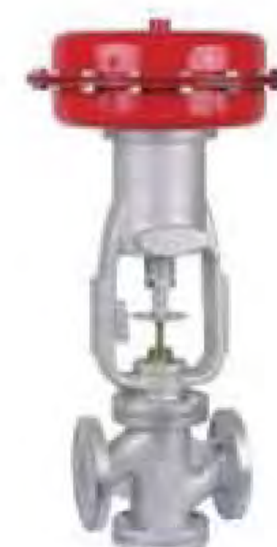
Diaphragm Control Valve