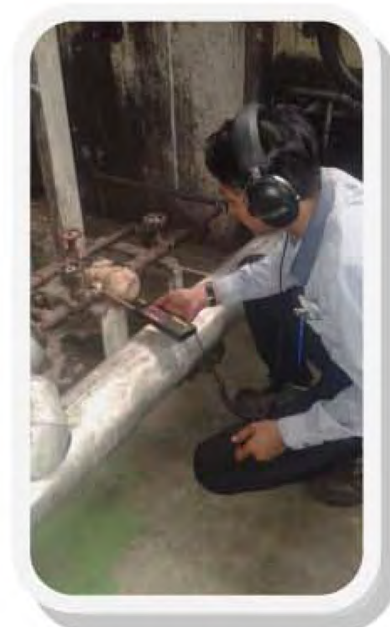
Cek kebocoran steam trap