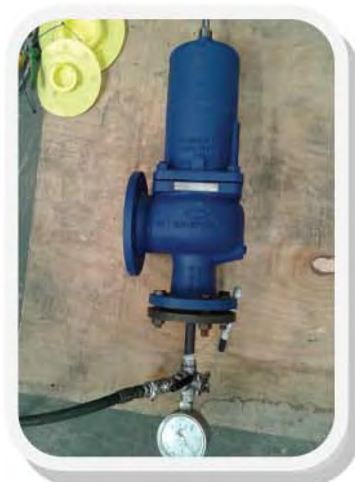
Sett Peressure Safety Valve