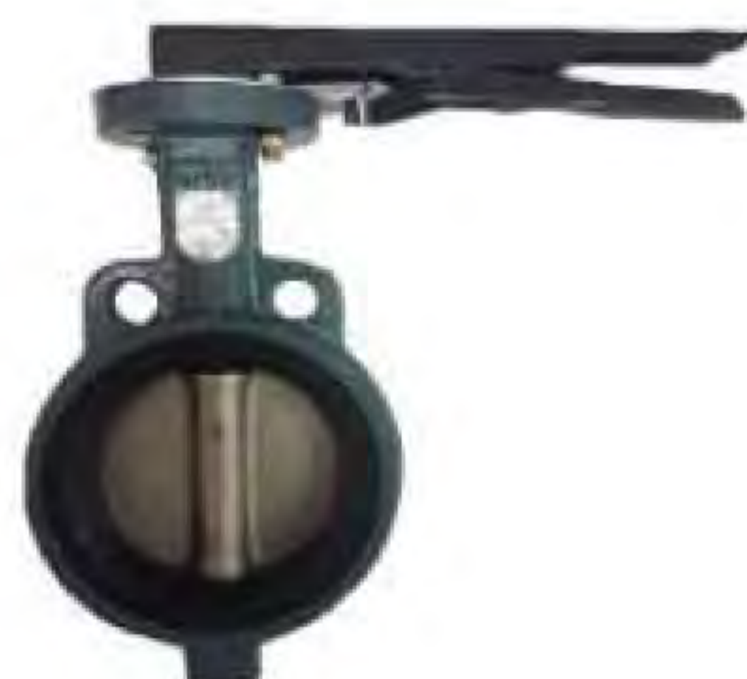
BUTTERFLY VALVE Body : CAST IRON Conn : JIS 10K Rating : 10K Size : 1/4"-24"