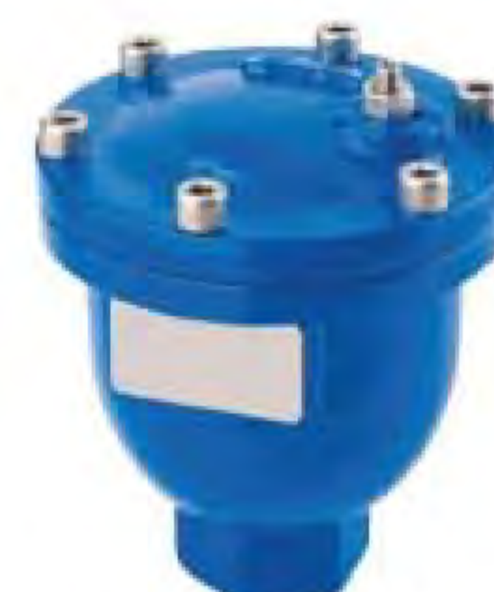
Air Vent Valve