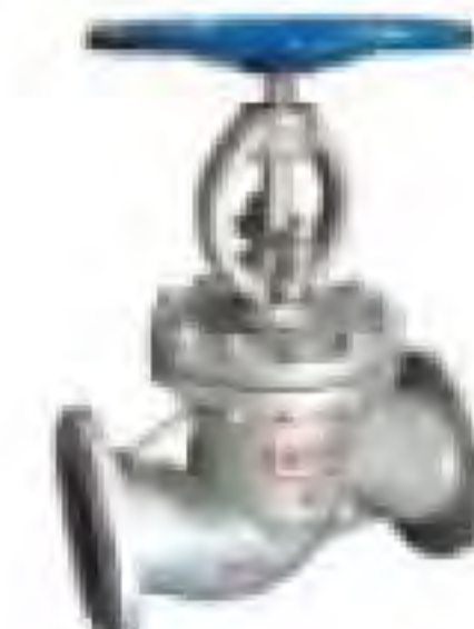
GLOBE VALVE Body : WCB Conn : PN16 Disc : 304,316 Size : 1/4"- 12"