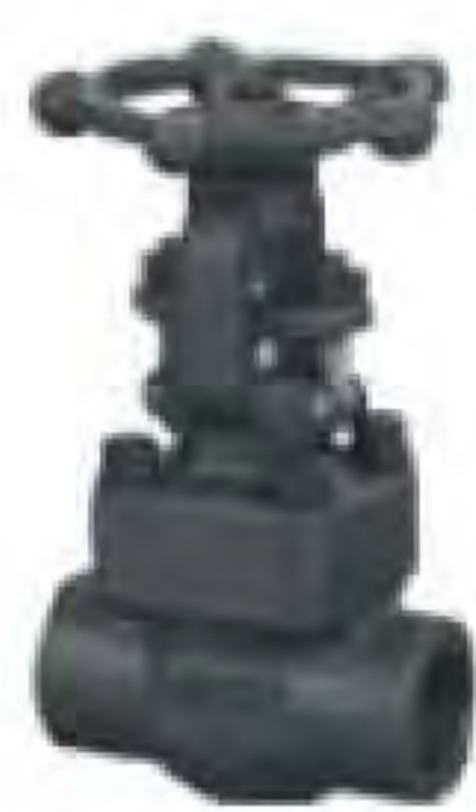
GATE VALVE Body : WCB A105 Conn : NPT, SW,BW Size : 1/4"- 2"