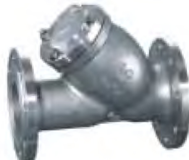
Y-STRAINER VALVE Body : 304, 316 Conn : PN16 Rating : PN16 Size : 1/2'-12'