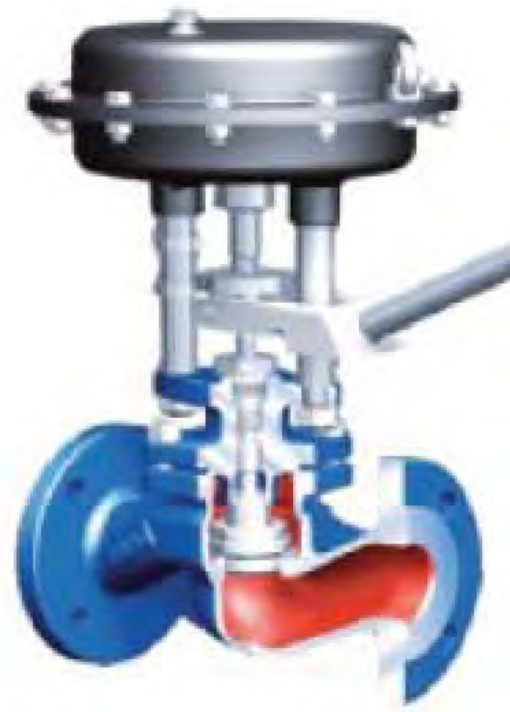
ARI BLOWDOWN CONTROL VALVE GGG 40.3 C/S PN40