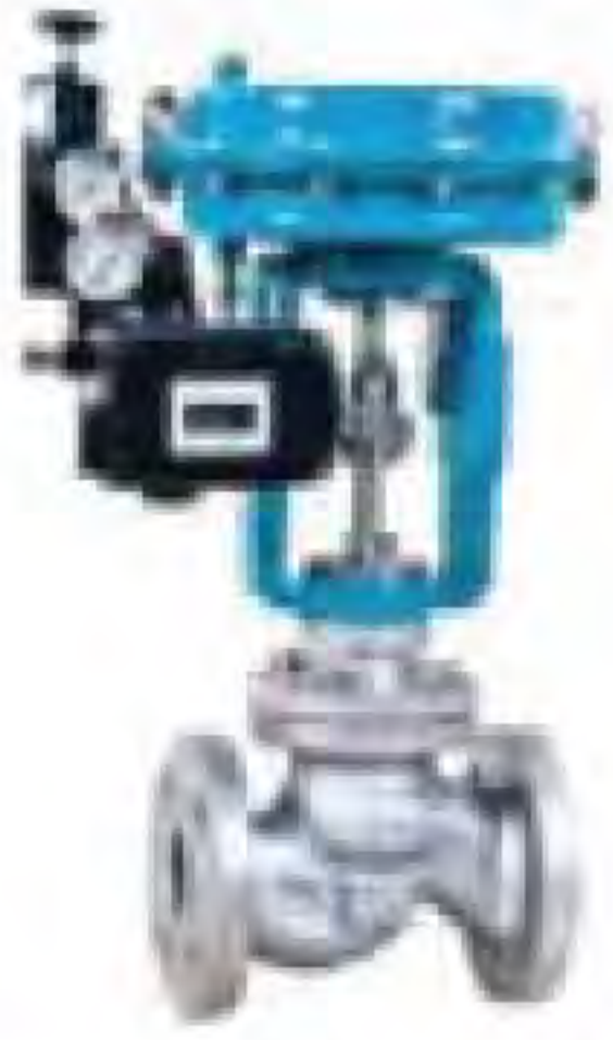
PNEUMATIC CONTROL VALVE Body : DUCTILE IRON Conn : PN16-PN40 Size : 1/2"- 12"