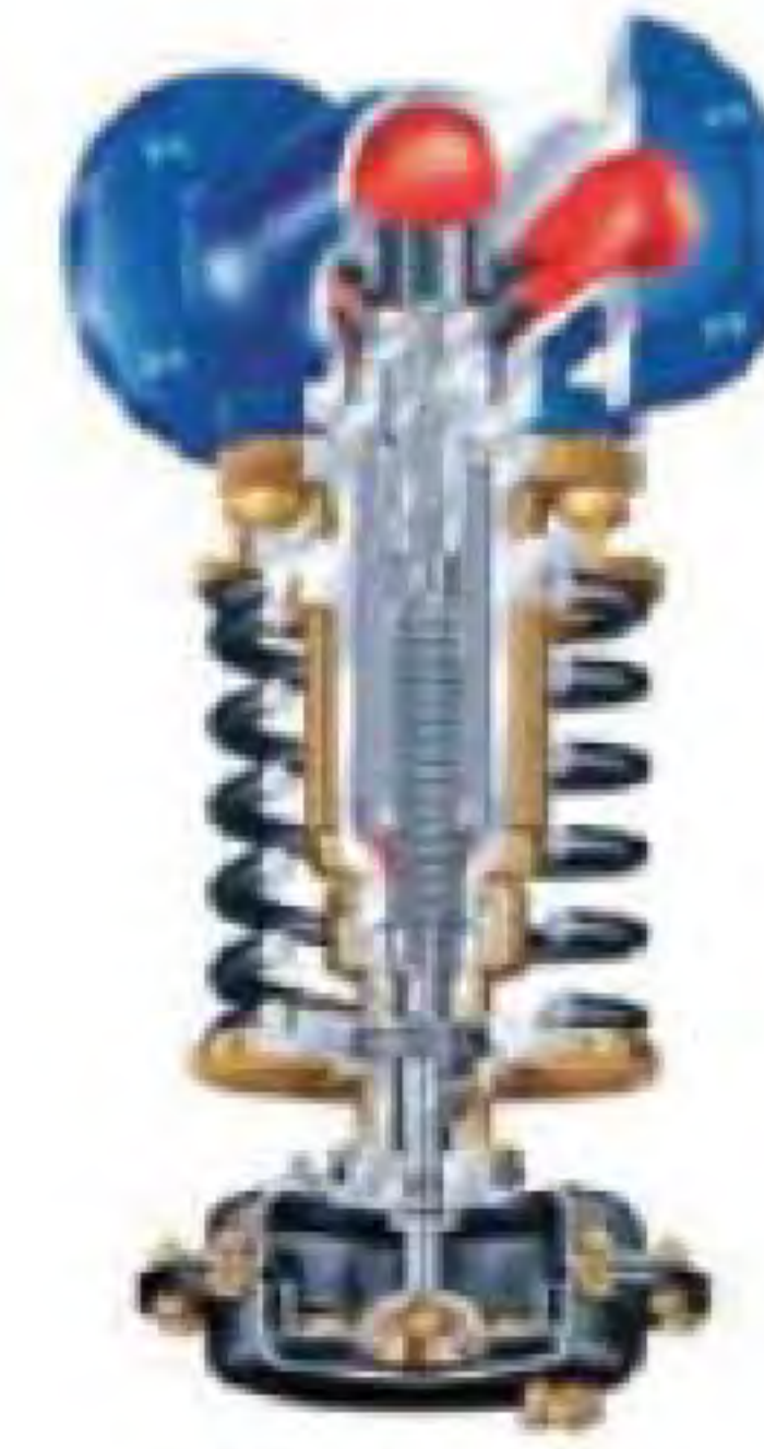
ARI PREDU GG25,GGG 40.3 C/S PN16, PN25, PN40