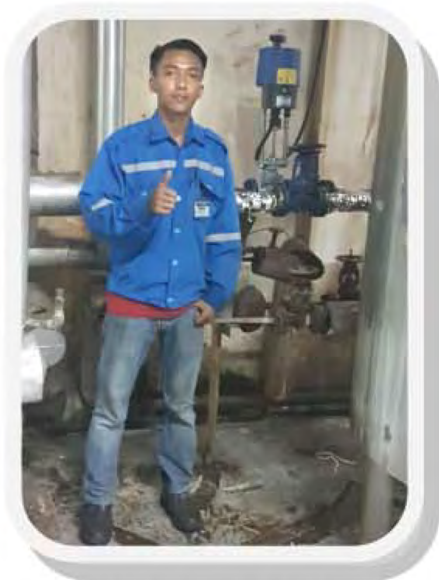
Supervisi pemasangan Instalasi Control Valve System