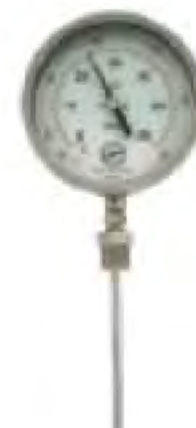
BIMETAL AND GAS EXPANSION THERMOMETER