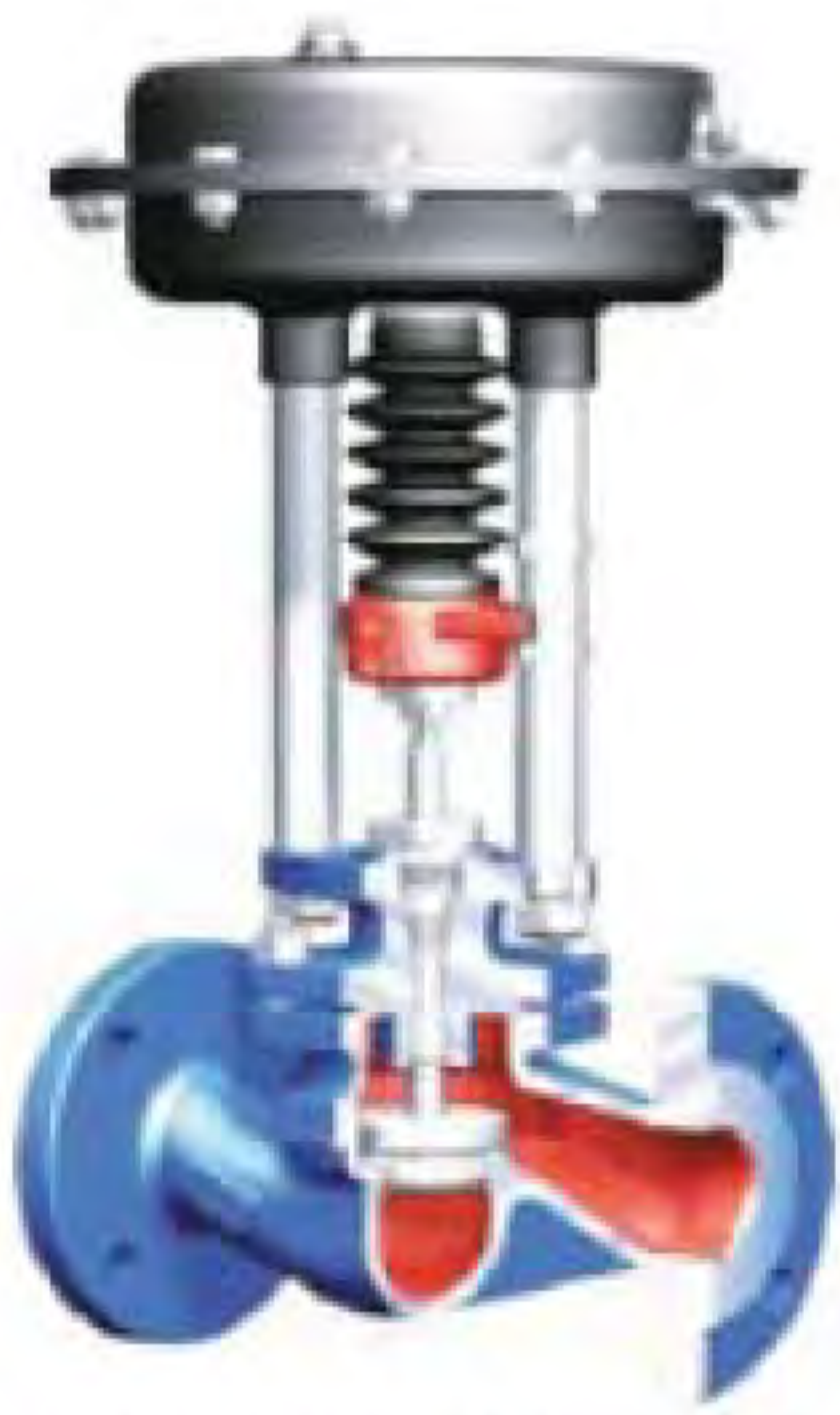
ARI PNEUMATIC CONTROL VALVE GG 25, GGG 40.3 C/S PN16, PN25, PN40