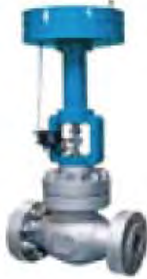
HIGH PRESSURE CONTROL VL Body : WCB Conn : : UP TO ANSI 4500 Size : 1/2"- 12"