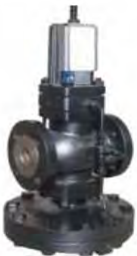
PRESSURE REDUCING VALVE Body : WCB Conn : PN16/PN40 Size : 1/2"-3"