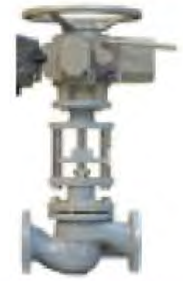
MULTI TURN ELECTRIC CV Body : CI,DI,CS,304/16 Conn : PN16-PN40 Size : 1/4"- 4"/200