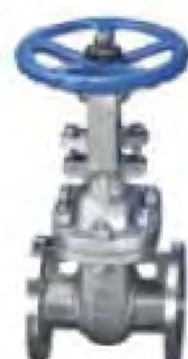
GATE VALVE Body : 304,316 Conn : JIS10K Size : 1/4"- 12"