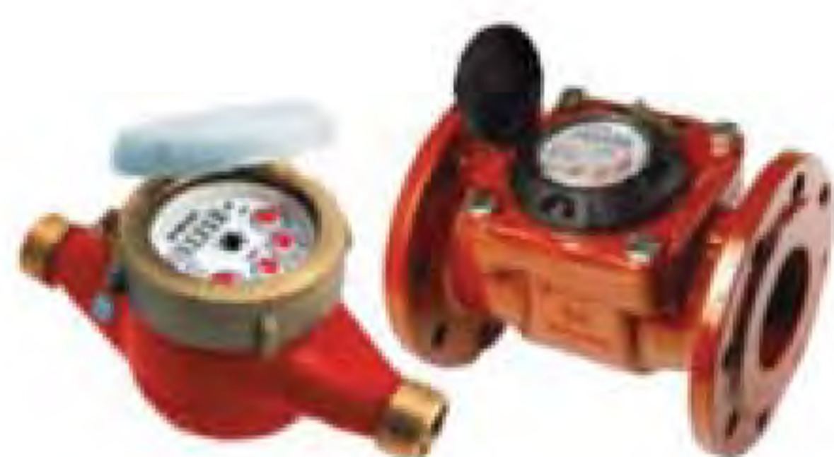
Hot Water Meter