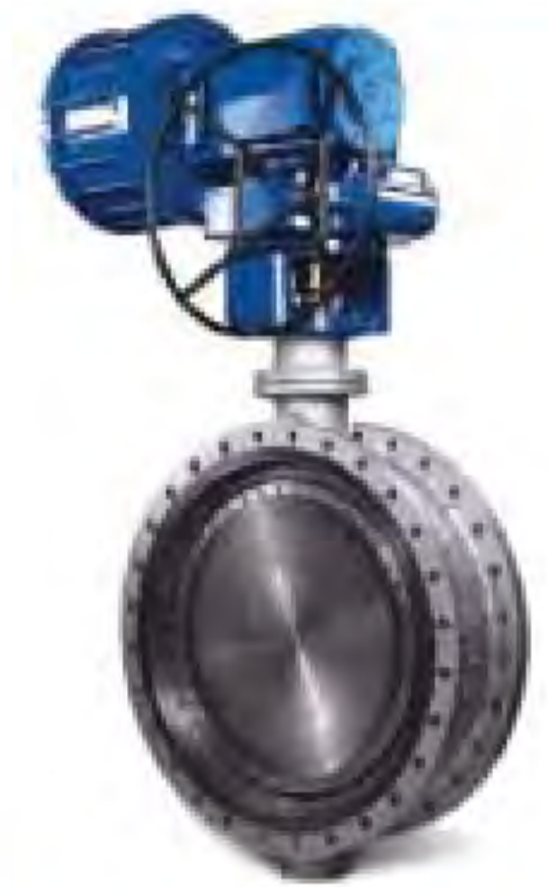
TRIPLE OFFSET BUTTERFLY VL Body : WCB,304,316 Conn : ANSI150-1500 Size : 1/2"- 12"