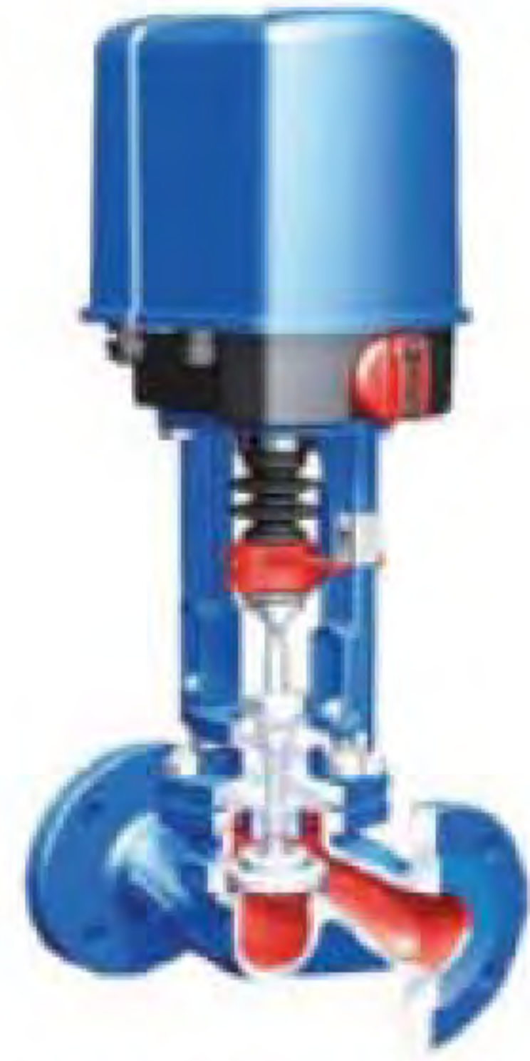
ARI ELECTRIC CONTROL VALVE GG 25, GGG 40.3 C/S PN16, PN25, PN40