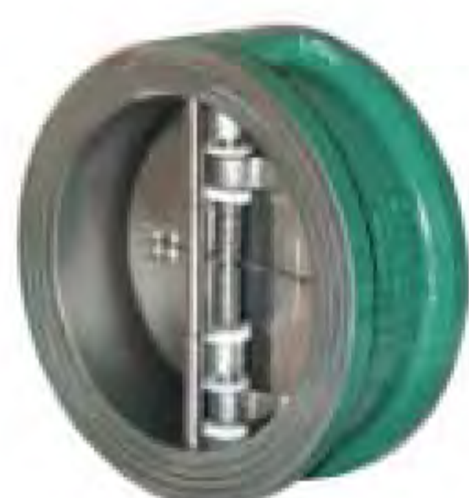
Double Disc Check Valve