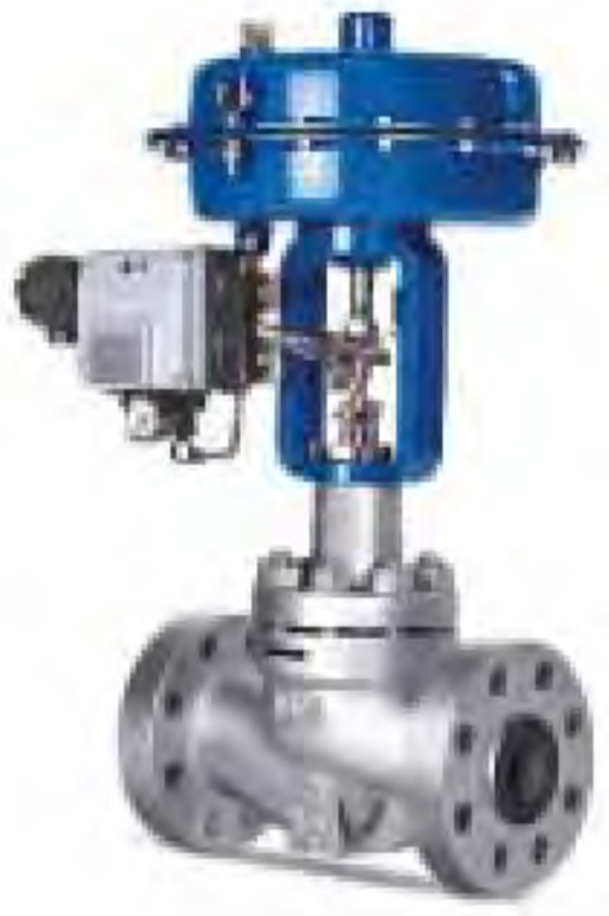
PNEUMATIC CONTROL VALVE Body : WCB Conn : PN16-ANSI1500 Size : 1/2"- 12"