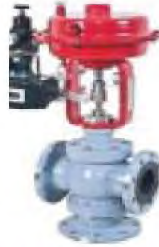
3WAY CONTROL VALVE Body : CI, DI, SS304/16 Conn : PN16-PN40 Size : 1/2"- 12"