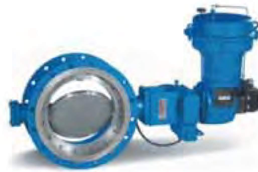
BUTTERFLY C/W ACTUATOR Body : WCB,304/316 Conn : ANSI150-1500 Size : 1/2"- 12"