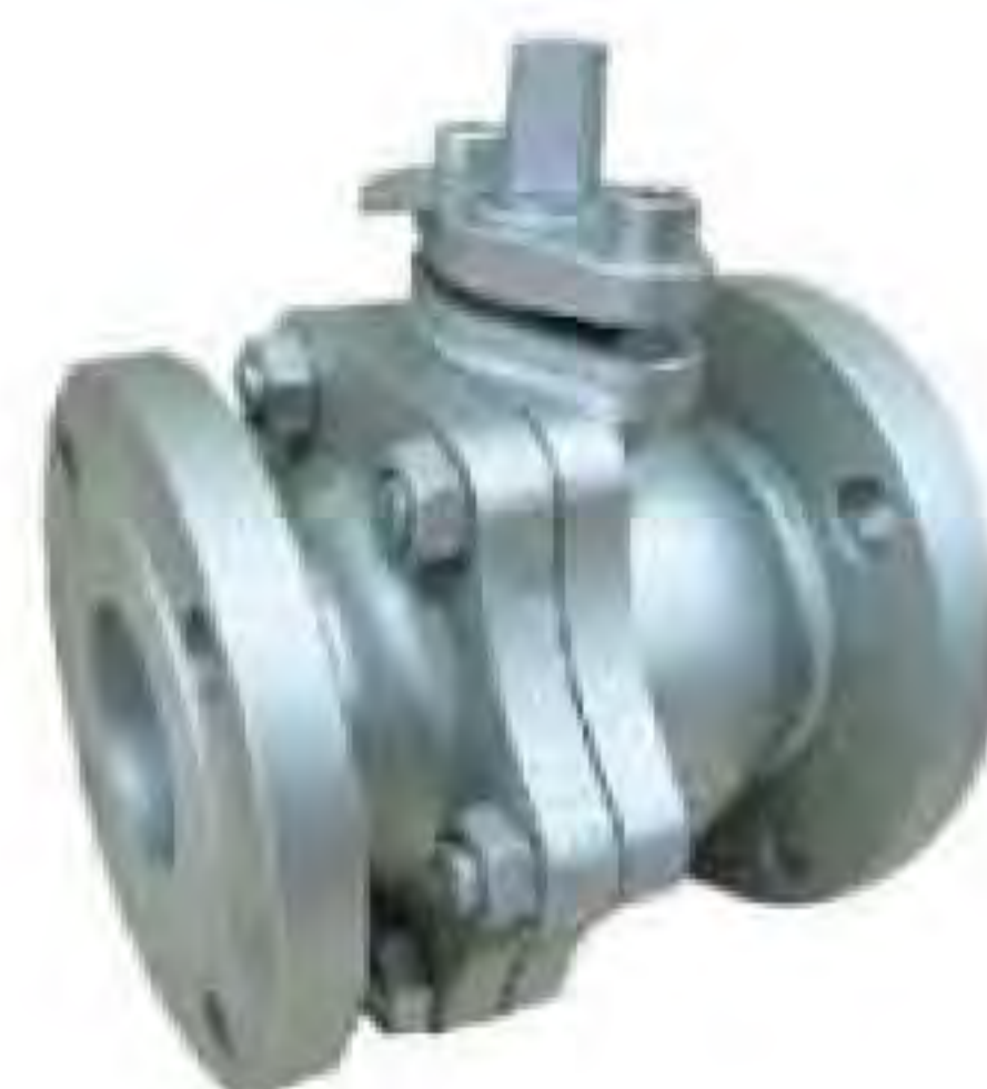
BALL VALVE Body : CAST IRON Conn : JIS 10K Rating : 10K Size : 1/4"-12"