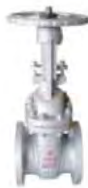
GATE VALVE Body : WCB Conn : ANSI 150,300 Size : 1/4"- 12"