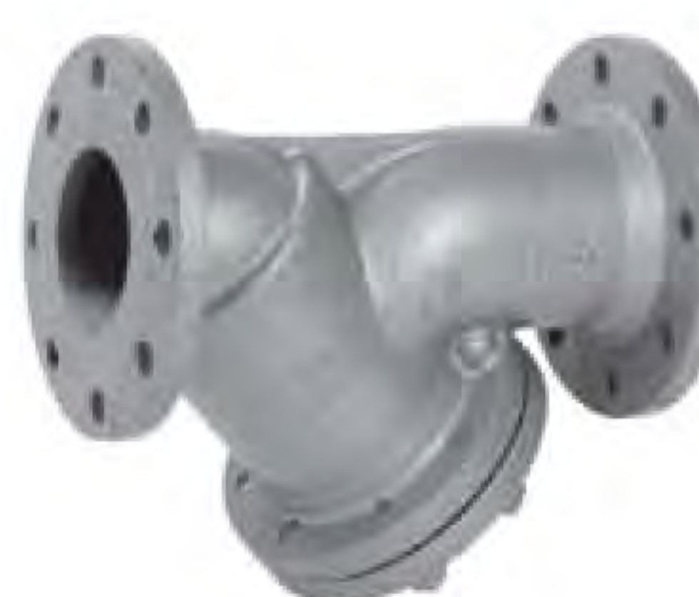
Y-STRAINER Body : CAST IRON Conn : JIS 10K Rating : 10K Size : 1/4"-12"