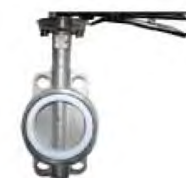
BUTTERFLY VALVE Body : ALL 316 Conn : 10K,PN16,#150 Rating : 10K Size : 1/2'-24'