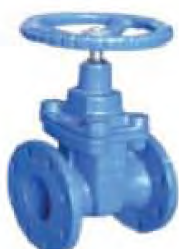
Gate Valve Resilent